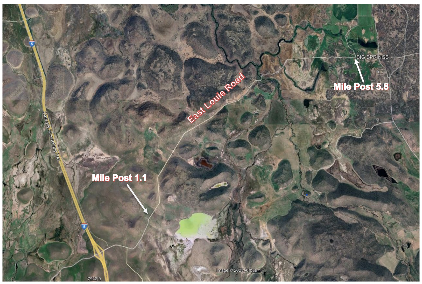
Figure 4: Traffic Count Locations

The Planning Commission must consider the proposed CEQA exemptions together with any comments received during the public review process. Further, the exemptions can only be approved if the Commission finds, based on the whole record before it, that there is not substantial evidence that there are unusual circumstances (including future activities) which might reasonably result in the project having a significant effect on the environment.