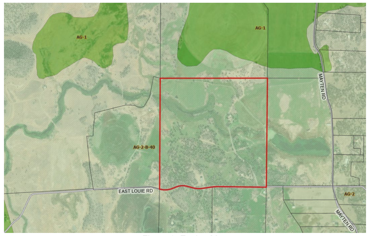
Figure 3: Zoning Map

To this end, on February 17, 2025, the Siskiyou County Agricultural Preserve Administrator made the determination that the proposed use was compatible with the existing agricultural uses and it will not displace any agricultural uses.